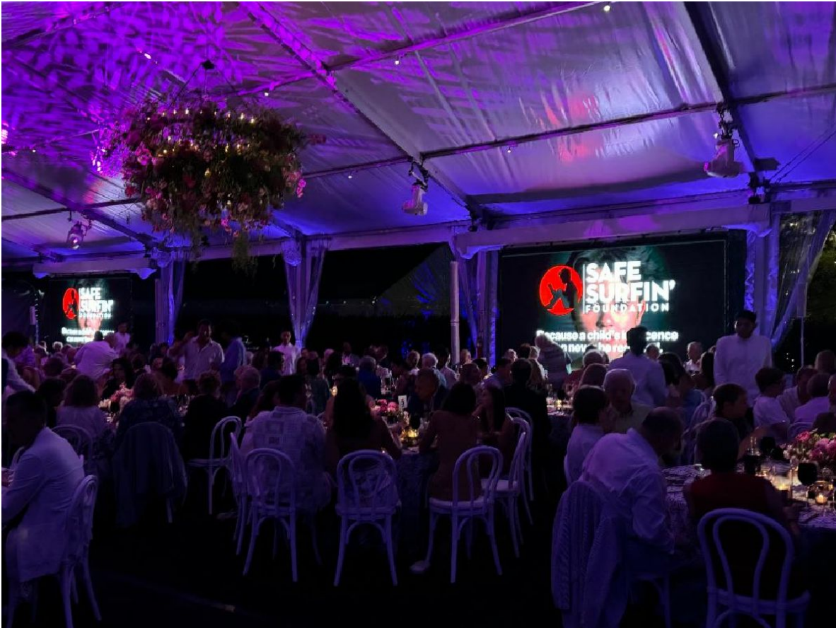
Safe Surfin' Foundation Sponsors Guild Hall Summer Gala in The Hamptons